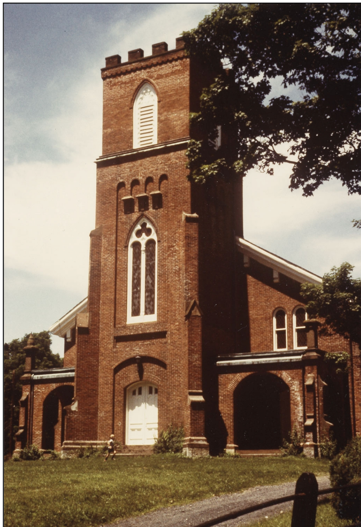
The Dutch Reformed Church in Montgomery, New York.