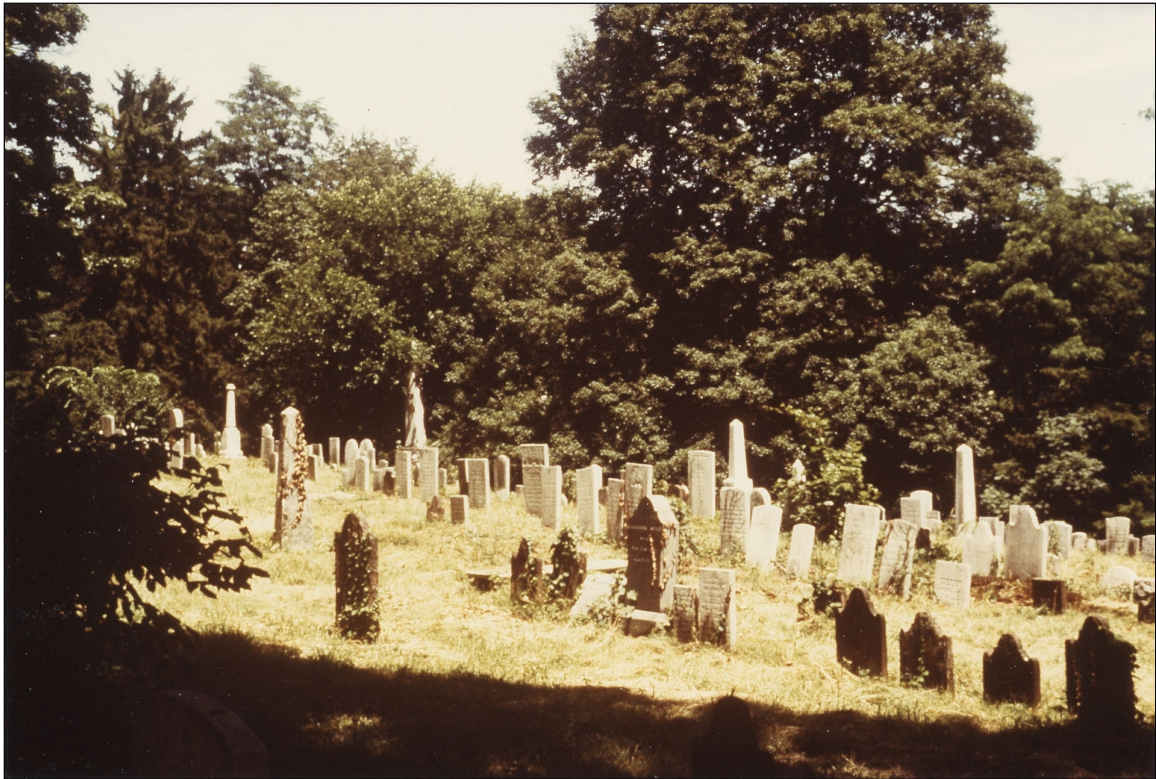
Cemetery of the Dutch Reformed Church.

Frederick Roat died on June 20, 1858, at the age of 84. He was buried in the Dutch Reformed Church Cemetery, but no stone has been located.