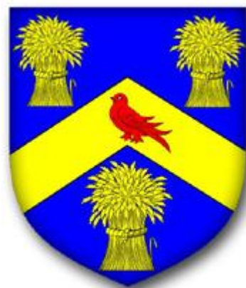
The Arms of Hatton of Woodhouse & Hellesby, as detailed in the Visitation of Chester 1580