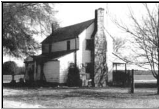
Figure 19 Solomon Wetherington Home c. 1850

A prominent farmer and landowner, the 1850 Craven County census lists Solomon Wetherington farming assets as 6 horses and mules, 90 head of cattle, 107 sheep, and 60 pigs. He also produced 800 bushels of corn, 500 bushels of sweet potatoes, and 200 pounds of wool. The 1850 industrial schedule lists Solomon as a turpentine maker, with assets of $8,175, 9 employees, and producing 1500 barrels of turpentine. Also Solomon appears on the 1850 slave schedule holding 18 slaves. 7