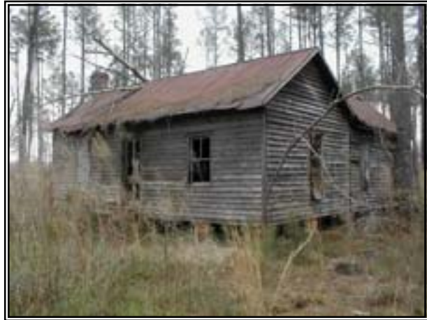
Figure 21 Wealthy Taylor Home