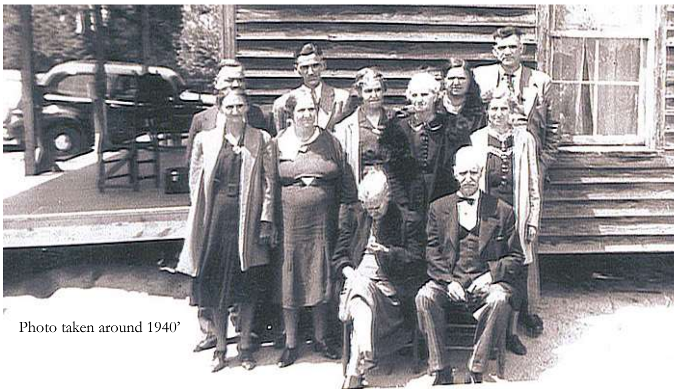
Photo taken around 1940'