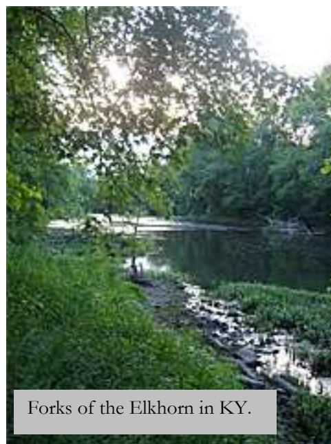
Forks of the Elkhorn in KY.