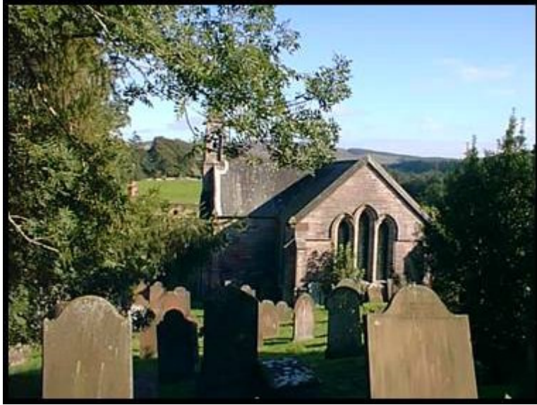
Figure 7 Tynron Churchyard