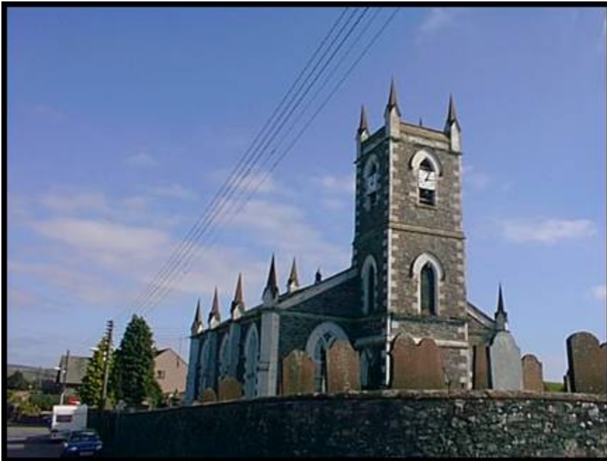
Figure 2 Dunscore Church ( Aug 2002).