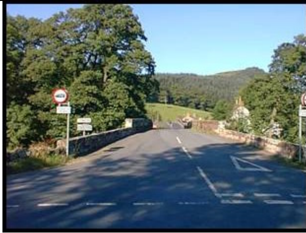
Figure 5 Tynron, Dumfries, Scotland. (Aug 2002).