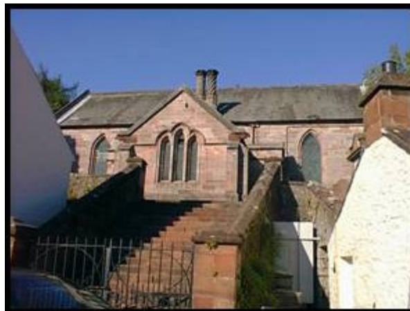
Figure 6 Tynron Church