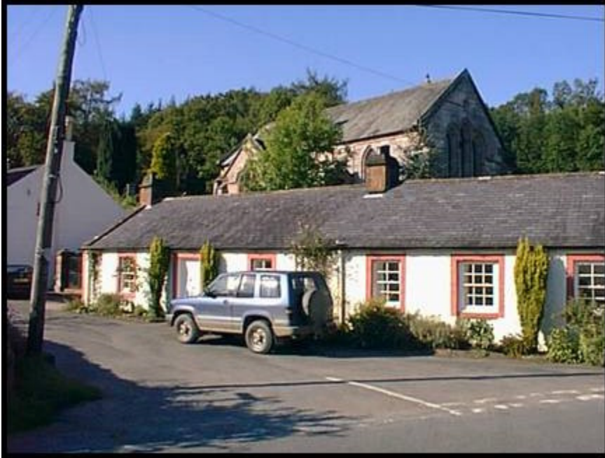
Figure 3 Tynron Church in the background (Aug 2002)