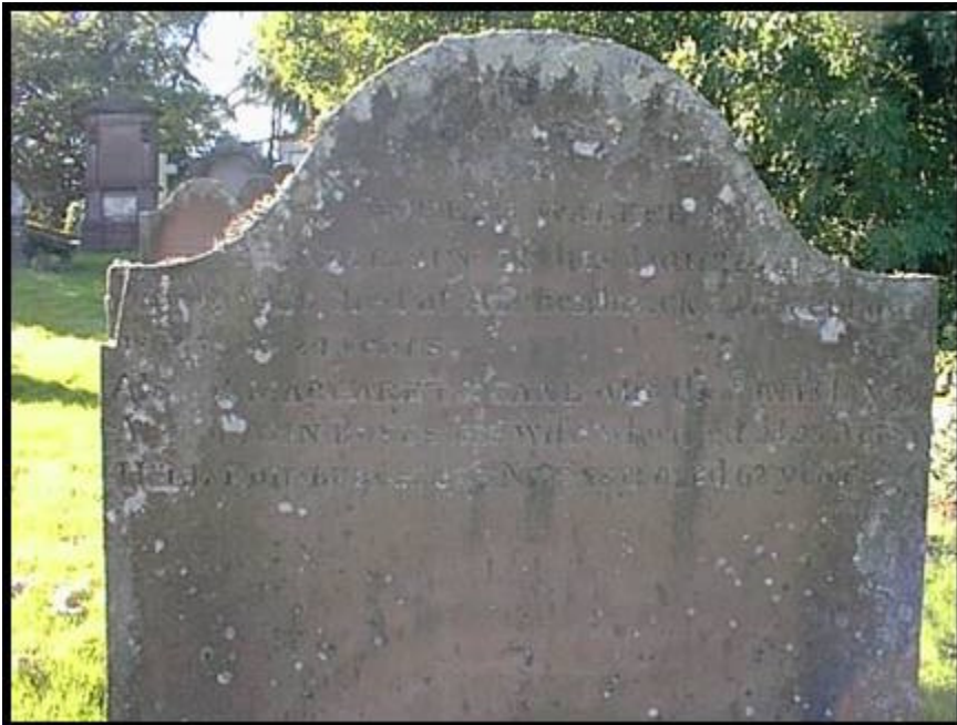
Figure 4 Walker headstone in Tynron churchyard (Aug 2002)