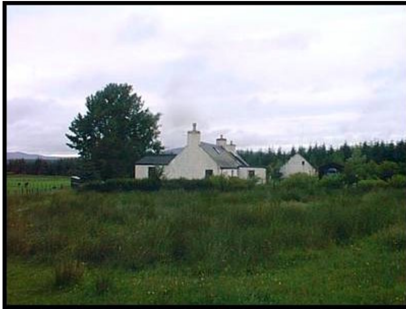
Figure 9 Crftindam, Cromdale, Scotland.

When they were married he was a railway porter.