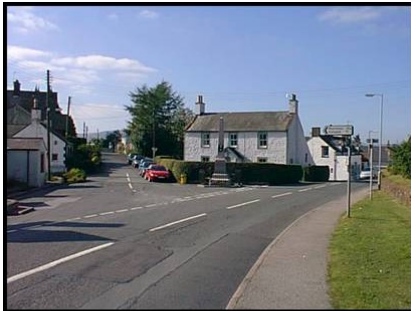
Figure 8 Dunscore, Dumfries, Scotland