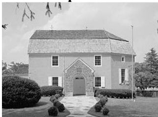
Old Trappe Church, built 1743