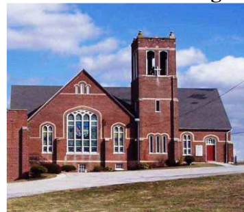
Sherman's (St. David's) Union Church

on land in the Piney Creek Hundred located in Frederick County, Maryland near the border with York County, Pennsylvania. This area was to become a part of Carroll County, Maryland when it was formed in 1836. During this time the Reinhard family