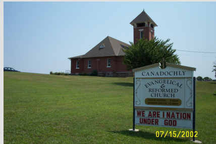
Canadochly Church, Lower Windsor Twp.