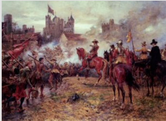
Cromwell's Army lays siege to Irish Castle

Based upon a timeline of the struggle between the English Parliament and King Charles I, Simon Dickson probably settled in Dromore, County Down, Ireland around 1651. Although no document has been forthcoming, some believe he was an Ensign or Lieutenant in the Parliamentary Army. It is most likely that he participated in the conquest of Ireland by Oliver Cromwell in 1649 - 50. As a reward for his military service he received a land grant of approximately 400 acres in County Down located within two miles of