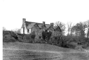
Hartshill Castle as it looked in 1927