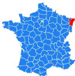
Location of Bas-Rhin