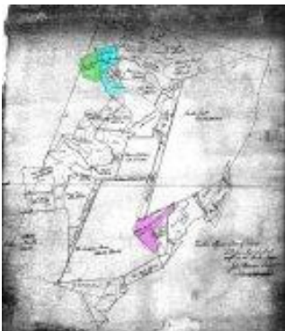
1789 Zachai Manor Survey showing Moreland property http://tinyurl.com/7n8pb98