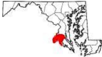
Charles County, Maryland http://tinyurl.com/6nlyko3