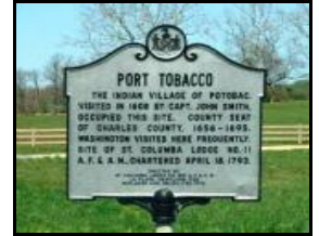
Port Tobacco- Marker http://tinyurl.com/894qxiw