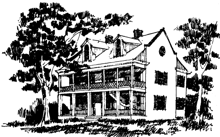
MISSISSIPPI'S SUMMER GOVERNOR'S MANSION