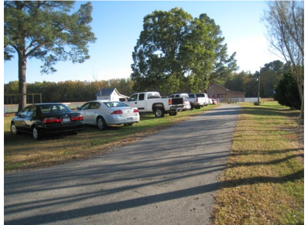
OUR VEHICLES HAD A PARTY IN THE DRIVEWAY