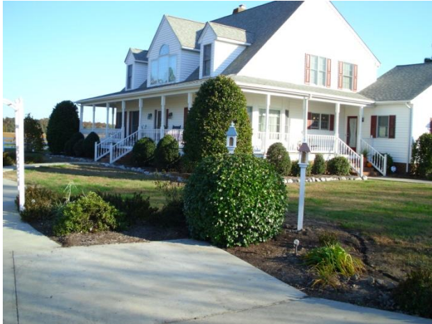
THE WHITE POST FARM, CORAPEAKE, GATES COUNTY, NC