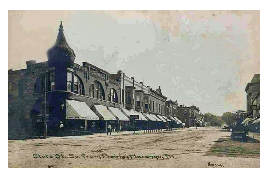
Pre 1900 State St. So. from Prairie, Marengo, Ill