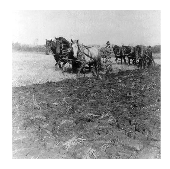
1903 Ploughing on a prairie farm, Illinois