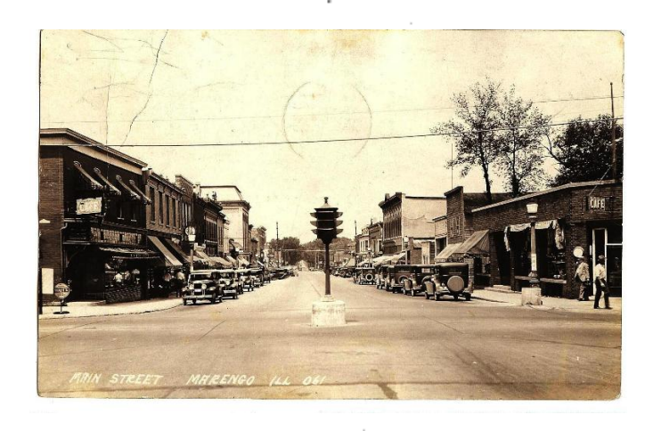
1910 approx Main Street in Marengo, Ill